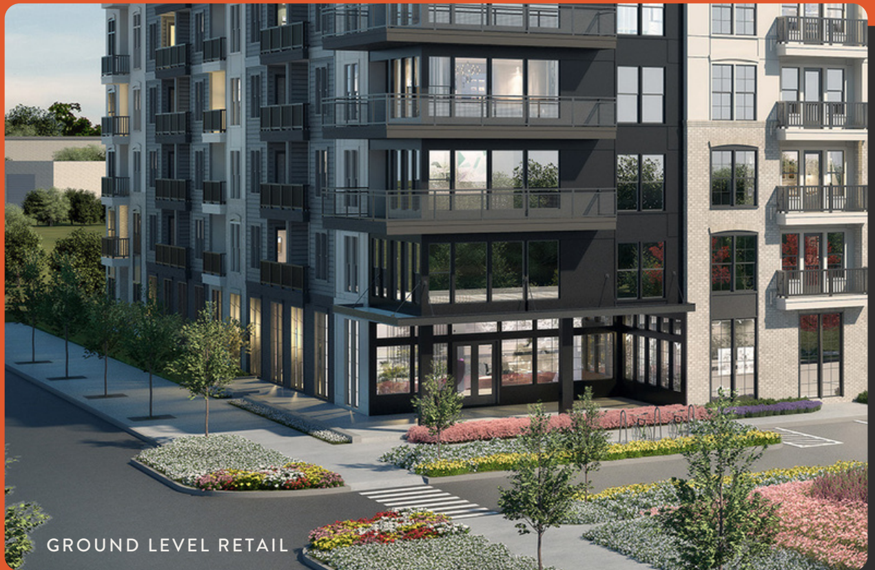
GROUND LEVEL RETAIL

Raven South End will consist of 261 one- and two-bedroom apartments in the South End's quickly growing mixed-use district of creative industries. It's just steps from Atherton Mill, Charlotte's Rail Trail and a vibrant collection of public art as well as the South End's award-winning restaurants and boutiques.