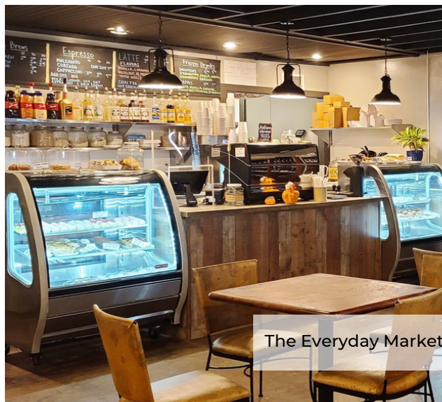
The Everyday Market