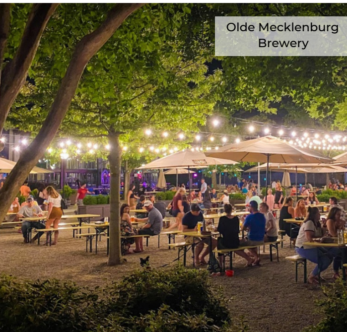
Olde Mecklenburg Brewery