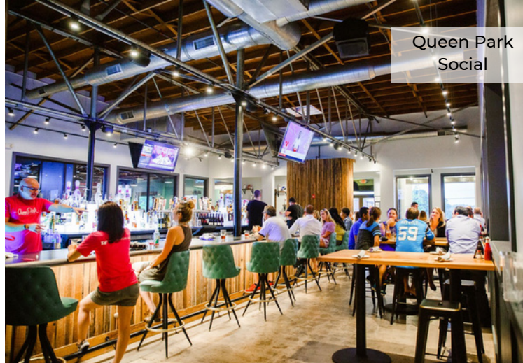
Queen Park Social