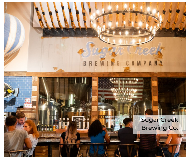
Sugar Creek Brewing Co.