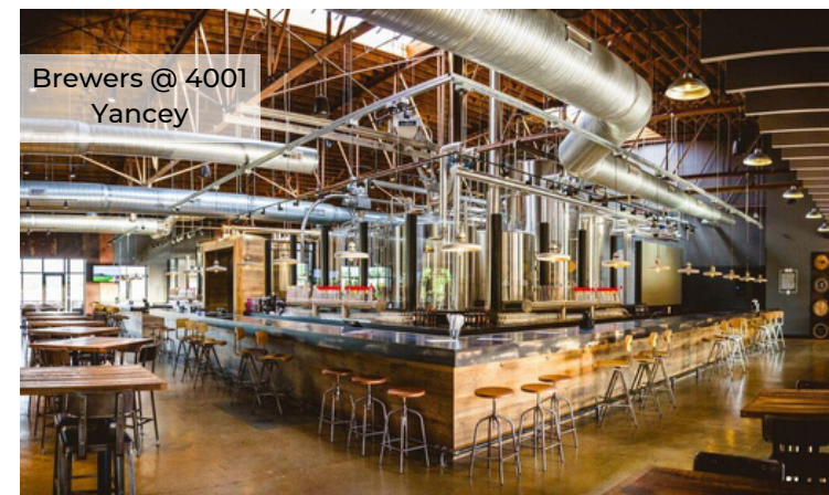
Brewers @ 4001 Yancey