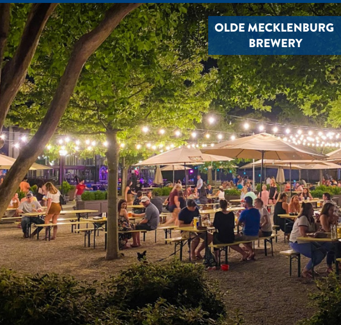
OLDE MECKLENBURG BREWERY