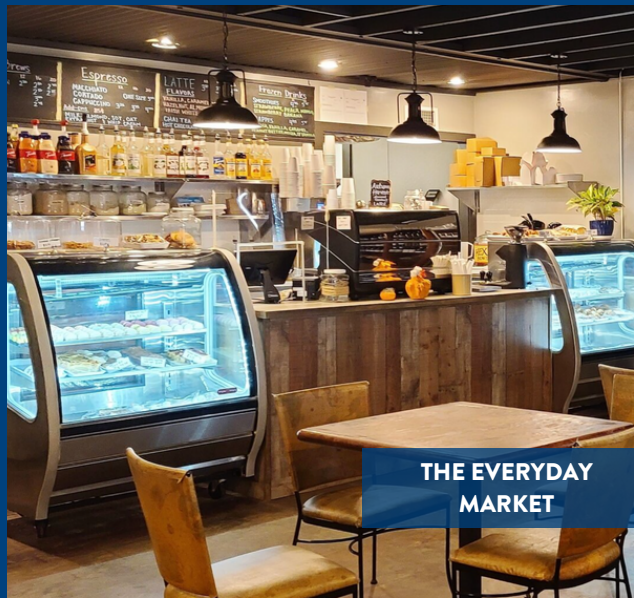
THE EVERYDAY MARKET