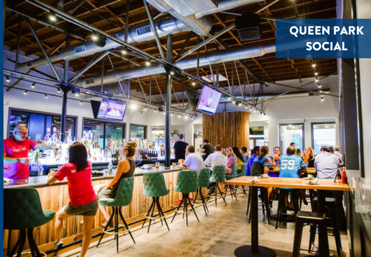
QUEEN PARK SOCIAL