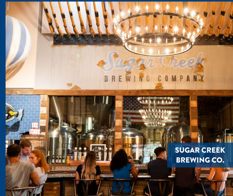
SUGAR CREEK BREWING CO.