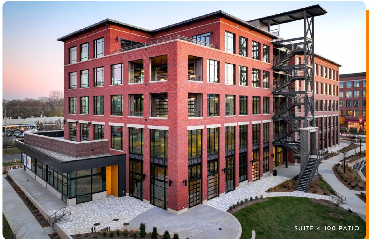
SUITE 4-100 PATIO

The LoSo neighborhood is the newest up and coming location in South End for new breweries, restaurants, residential and on-trend office space. The Station at Loso is a 15-acre mixed-use development ideally located on the Rail Trail in front of the Scaley Bark Light Rail Stop. The first phase, Station 3 and Station 4, will anchor this development, and provide a hub for the growing and vibrant neighborhood.