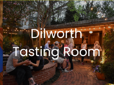
Dilworth Tasting Room