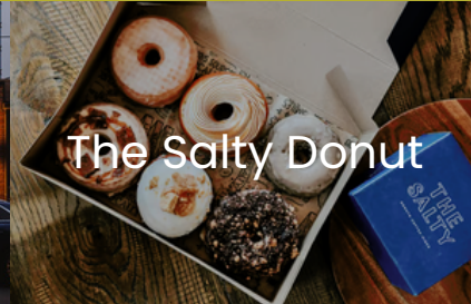
The Salty Donut