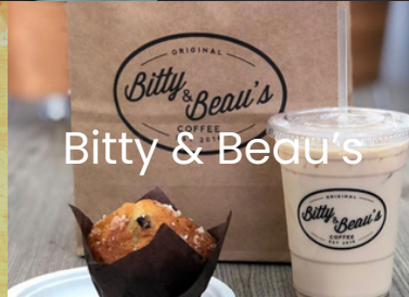
Bitty & Beau's