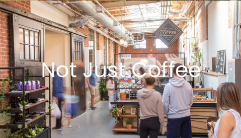
Not Just Coffee