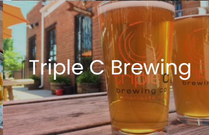
Triple C Brewing