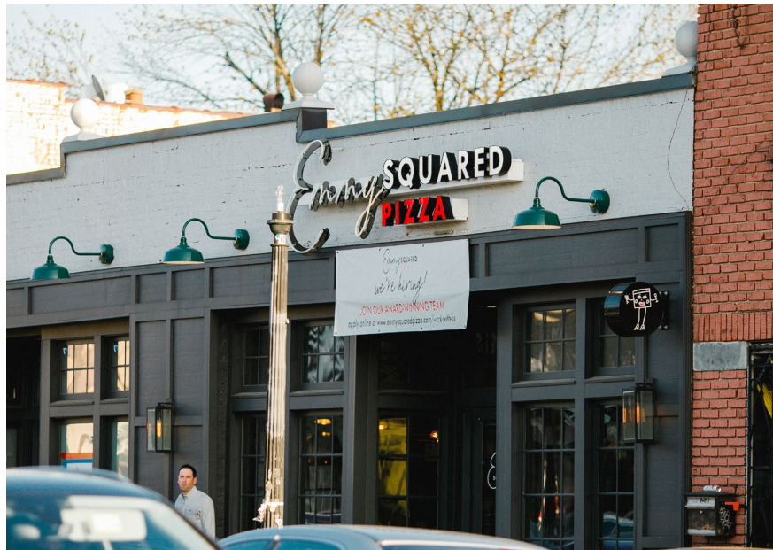
1508-1510 CENTRAL AVE