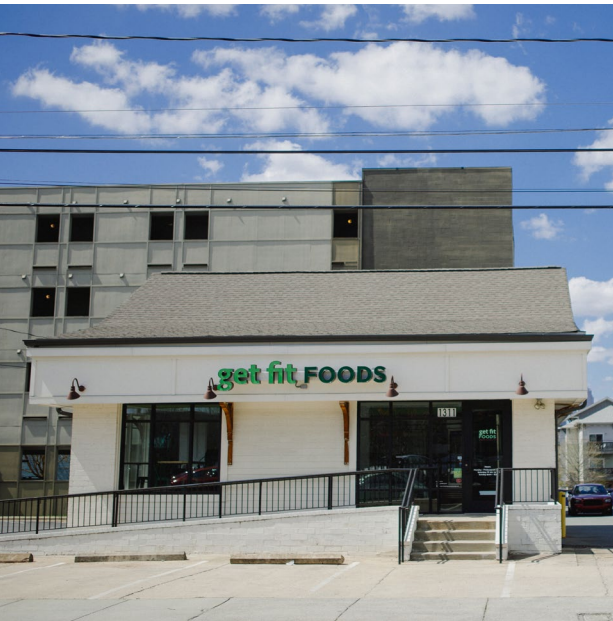
1311 PECAN AVE